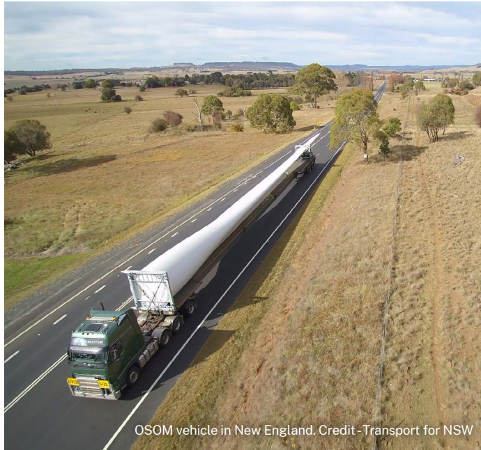
OSOM vehicle in New England.