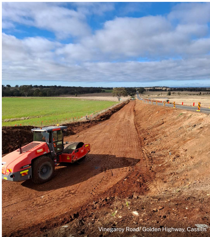
Vinegaroy Road/ Golden Highway, Cassilis