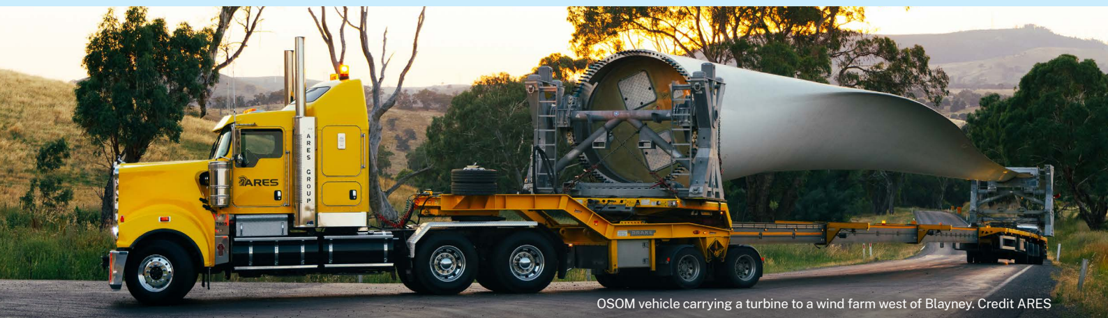
OSOM vehicle carrying a turbine to a wind farm west of Blayney.

EnergyCo is delivering renewable energy zones (REZ) to provide a clean, affordable and reliable power supply for energy consumers across NSW. EnergyCo and Transport for NSW are upgrading sections of the State-road network to enable the delivery of critical equipment needed to build renewable energy projects.