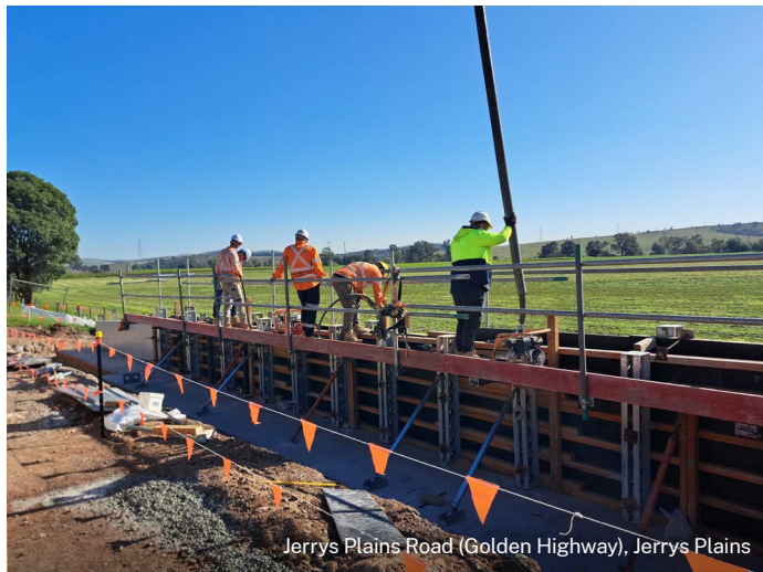
Jerrys Plains Road (Golden Highway), Jerrys Plains