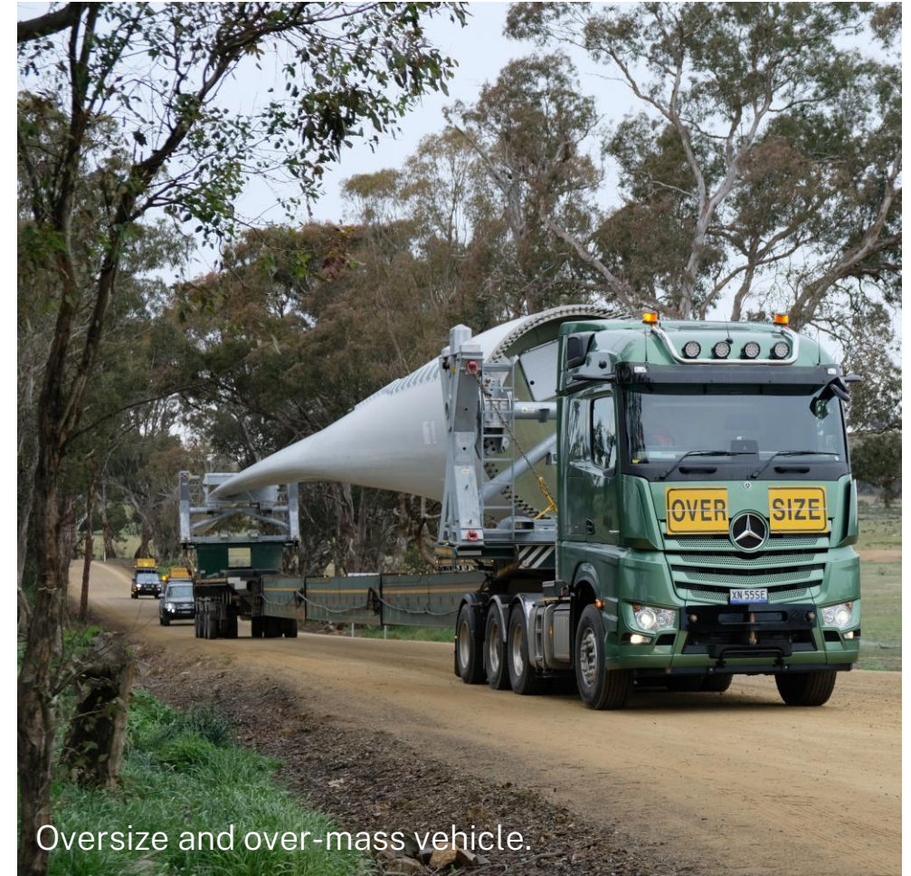
Oversize and over-mass vehicle.