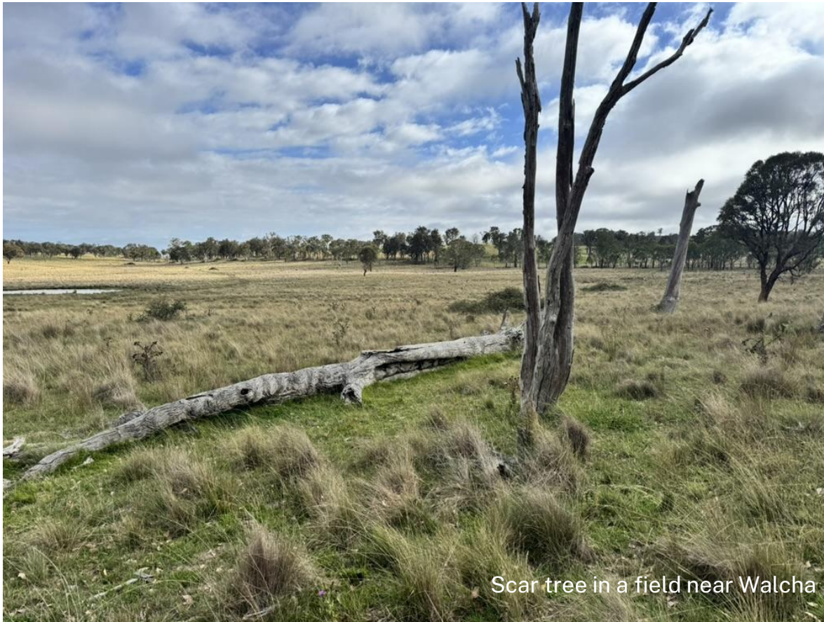
Scar tree in a field near Walcha