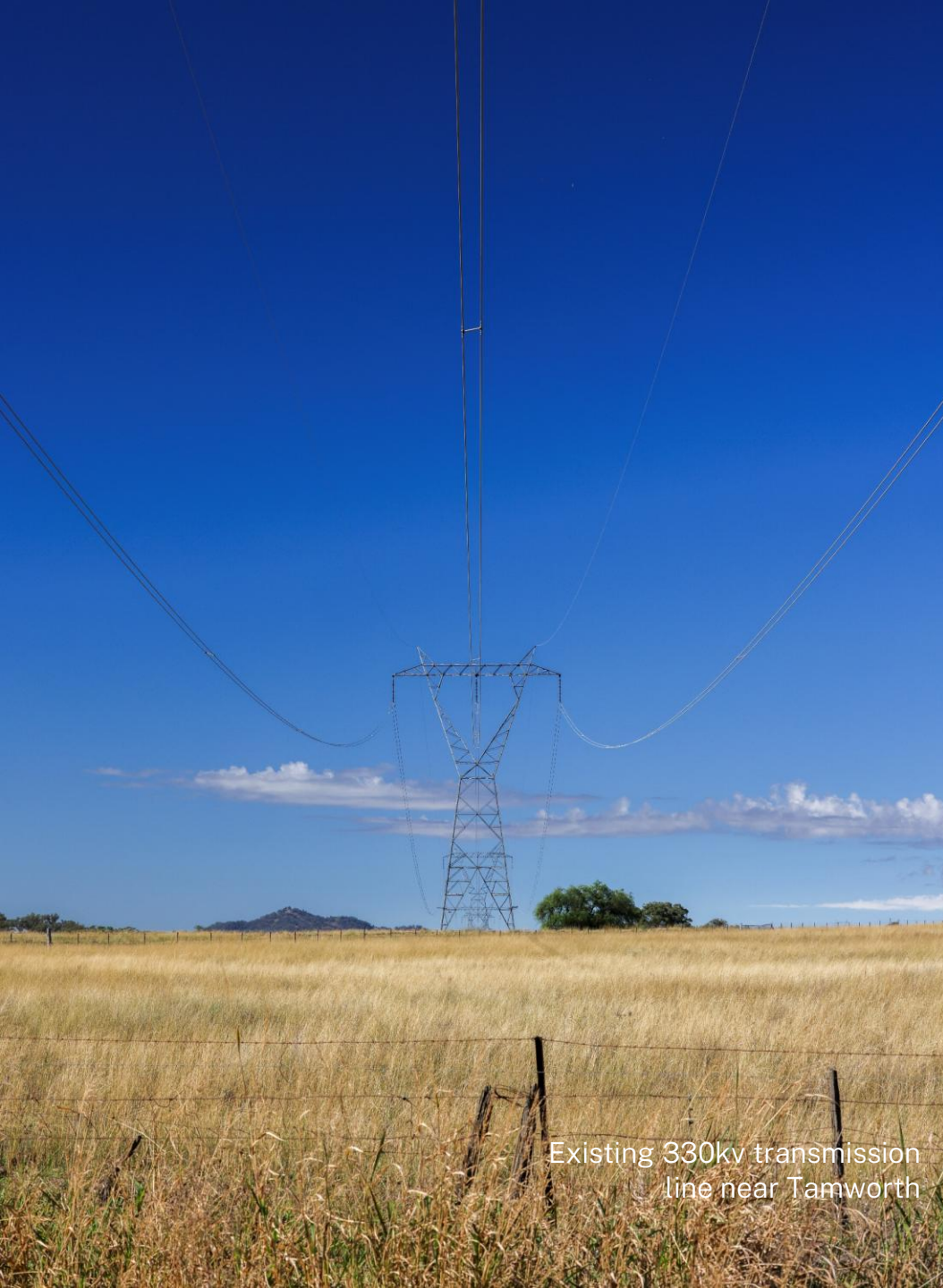
Existing 330kv transmission line near Tamworth