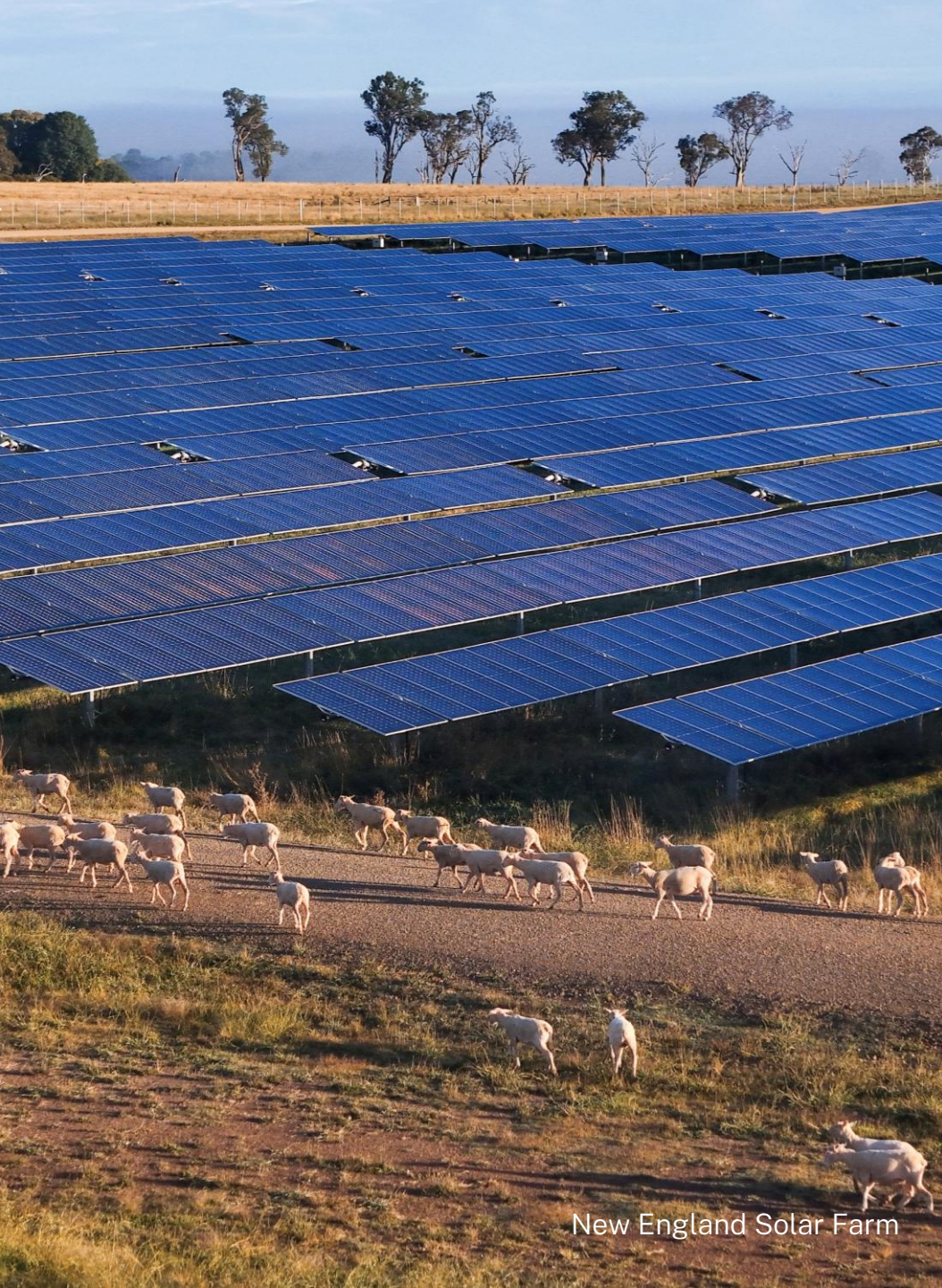
New England Solar Farm