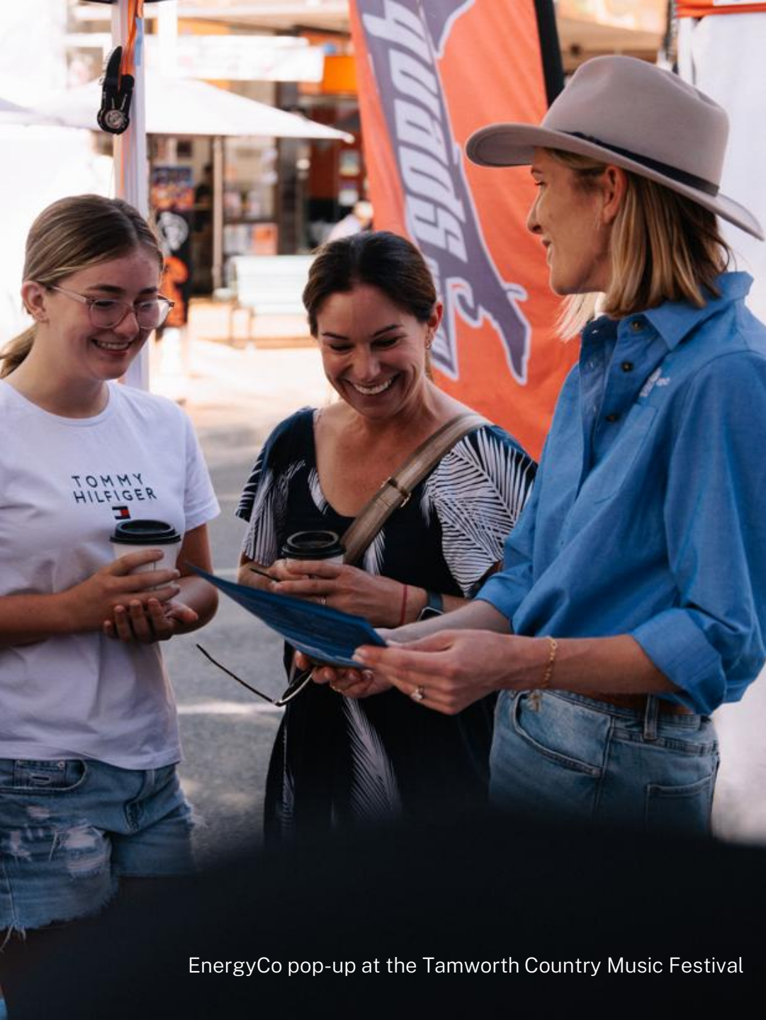
EnergyCo pop-up at the Tamworth Country Music Festival