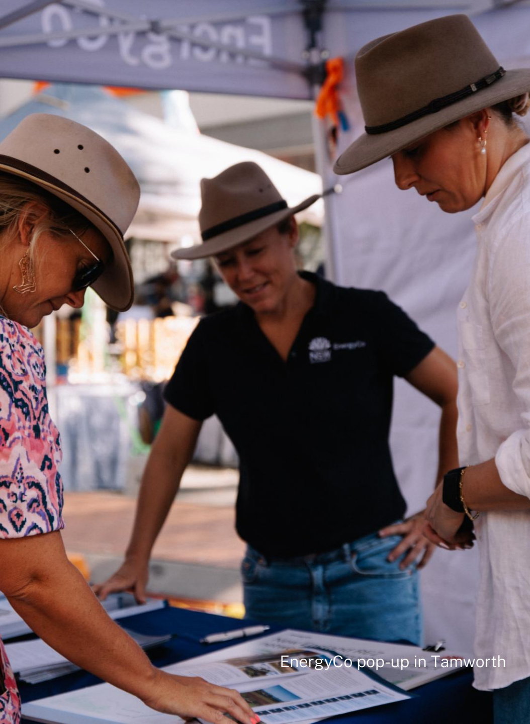
EnergyCo pop-up in Tamworth