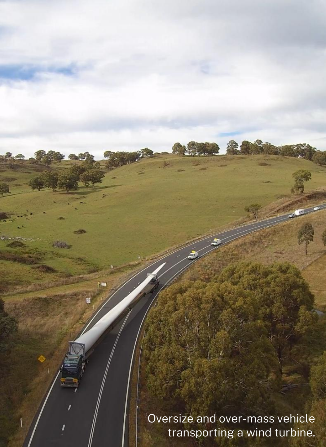
Oversize and over-mass vehicle transporting a wind turbine.

Early planning will ensure OSOM deliveries are safe, coordinated and aligned with construction timelines.