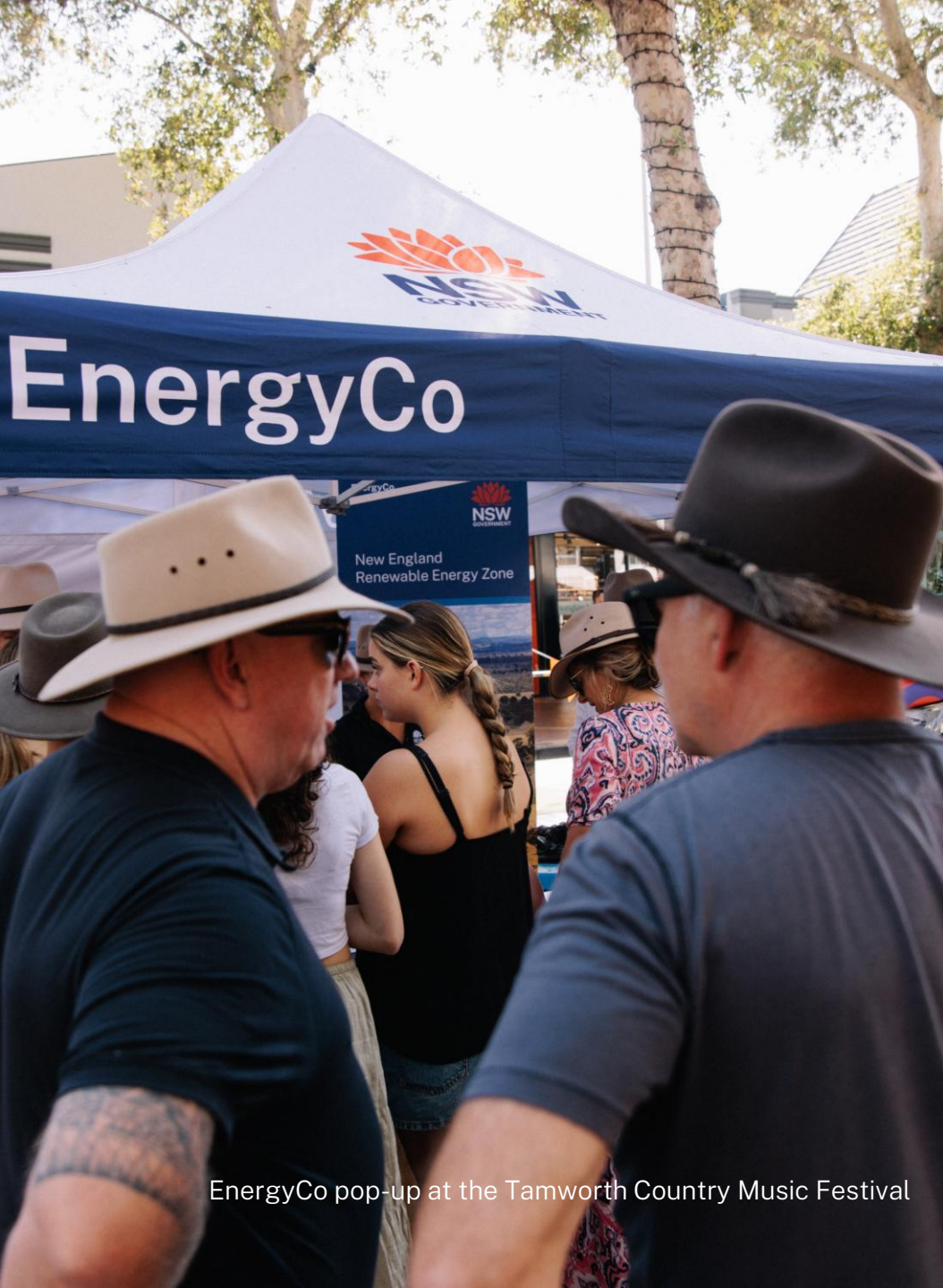
EnergyCo pop-up at the Tamworth Country Music Festival