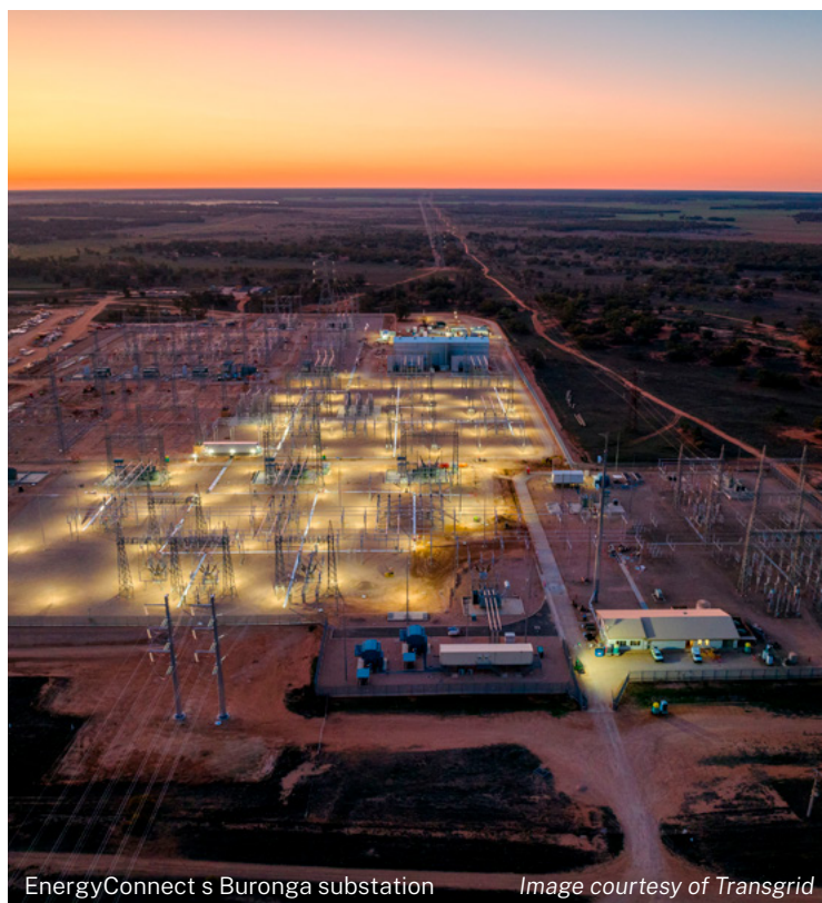
EnergyConnect s Buronga substation

The South West REZ will generate more than $17 billion in private investment, with more than $10 billion flowing into the NSW economy during construction and operation.