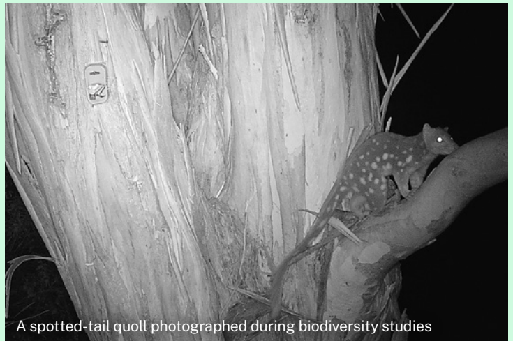
A spotted-tail quoll photographed during biodiversity studies

To date we have recorded 15 threatened species in the area, such as spotted-tail quolls and koalas. We have also recorded a range of commonly occurring species such as wombats, kangaroos, sugar gliders, echidnas and a range of birds.