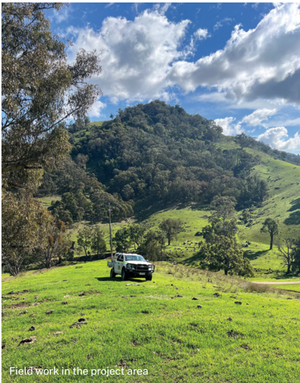
Field work in the project area