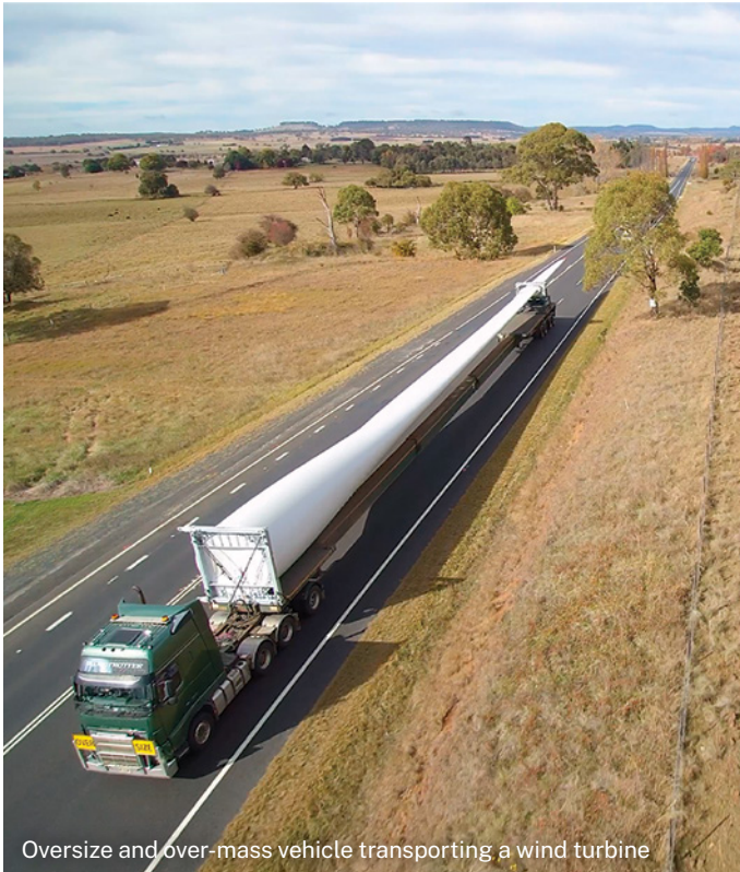
Oversize and over-mass vehicle transporting a wind turbine