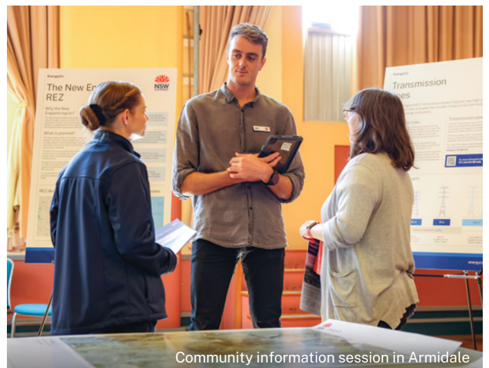
Community information session in Armidale

It was great to see a such a strong representation and we appreciate the valuable insights shared during the sessions. Key themes from feedback during the workshop will be instrumental in shaping the next steps of these initiatives to ensure First Nations initiatives are community-led, culturally appropriate and sustainable.