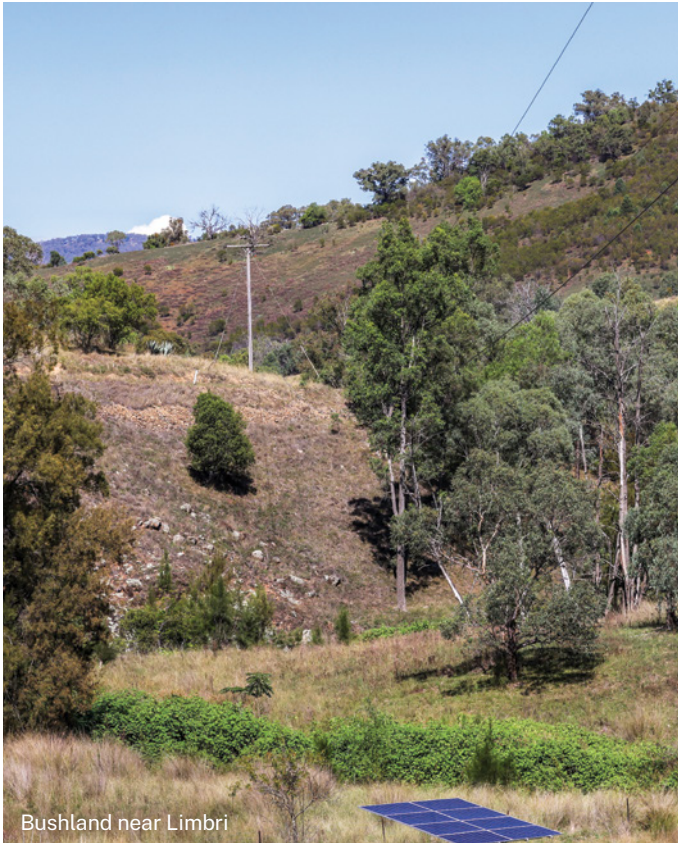
Bushland near Limbri