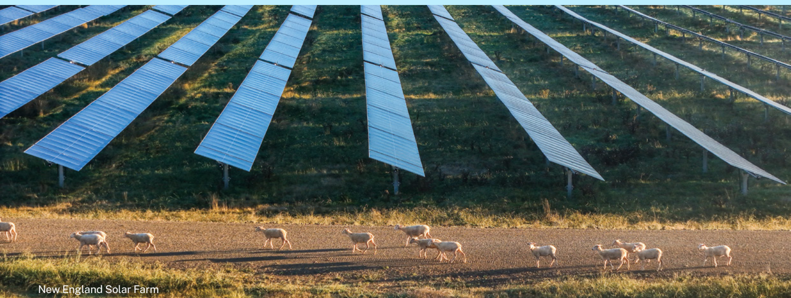
New England Solar Farm

EnergyCo is delivering the New England Renewable Energy Zone (REZ) network infrastructure project to provide a clean, affordable and reliable power supply for homes and businesses across NSW. The first two stages of the project are scheduled for completion by 2034 to ensure energy security across NSW as our coal-fired power stations retire.