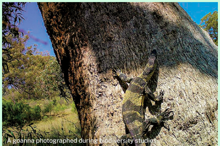
A goanna photographed during biodiversity studies