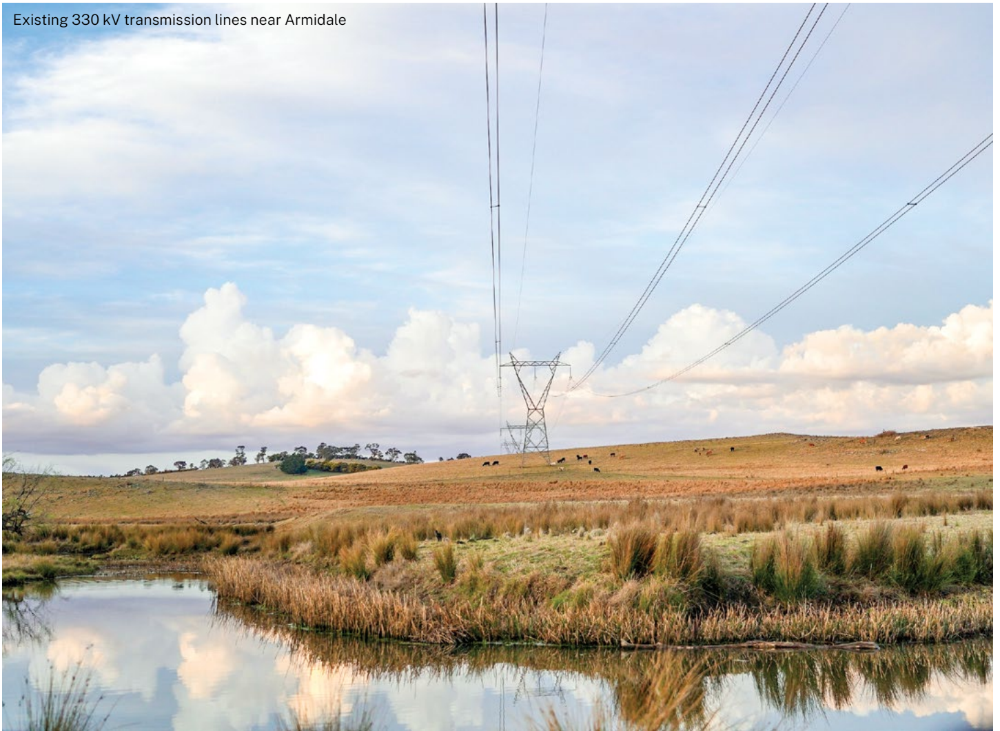
Existing 330 kV transmission lines near Armidale