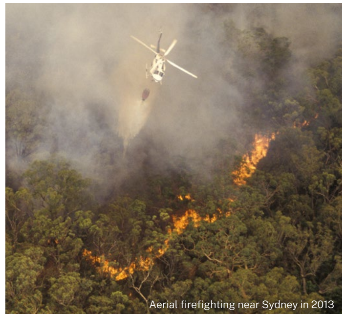
Aerial firefighting near Sydney in 2013

Transmission lines near bodies of water (such as dams) would not restrict the use of water scooping fixed wing aircraft and helicopters when conditions are suitable. Aircraft operators are aware of the location of transmission lines as they are published on aeronautical charts and covered in briefings for firefighting operations. The location of the transmission route would not restrict the use of Chaffey Dam by both water scooping fixed wing aircraft and helicopters.