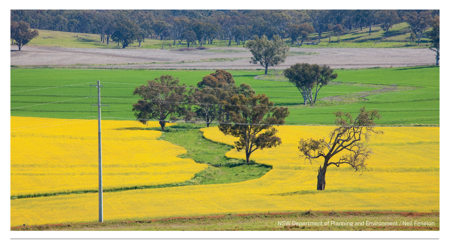
The Energy Corporation of NSW (EnergyCo) is part of the Treasury Cluster

Site tests include surface water sampling, groundwater monitoring and soil resistivity testing. All of these are conducted to confirm ground conditions and give us a better idea of the existing properties of the land. These tests are unintrusive, take half a day to conduct and will usually involve one or two workers with an accompanying light vehicle.