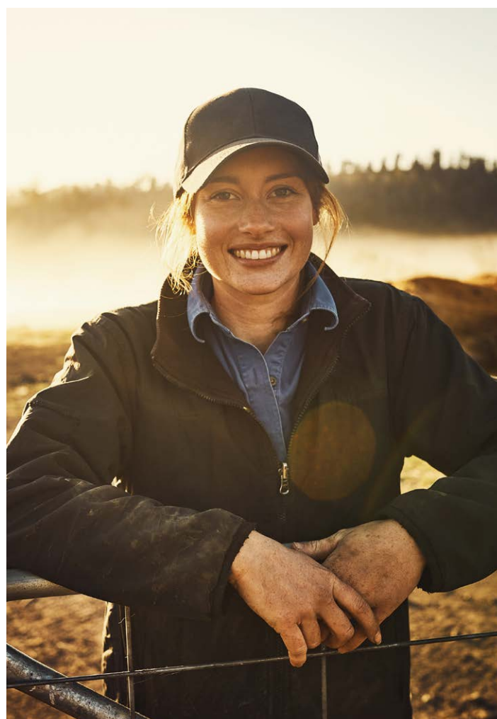
Woman on farm.

Payments under the scheme will be made to the current private landowner of the land. If the land is sold or transferred to a private entity within the 20-year period, payments would be made to the new owner. If the land is sold or transferred to a public entity within the 20-year period, SBPs would no longer be paid.