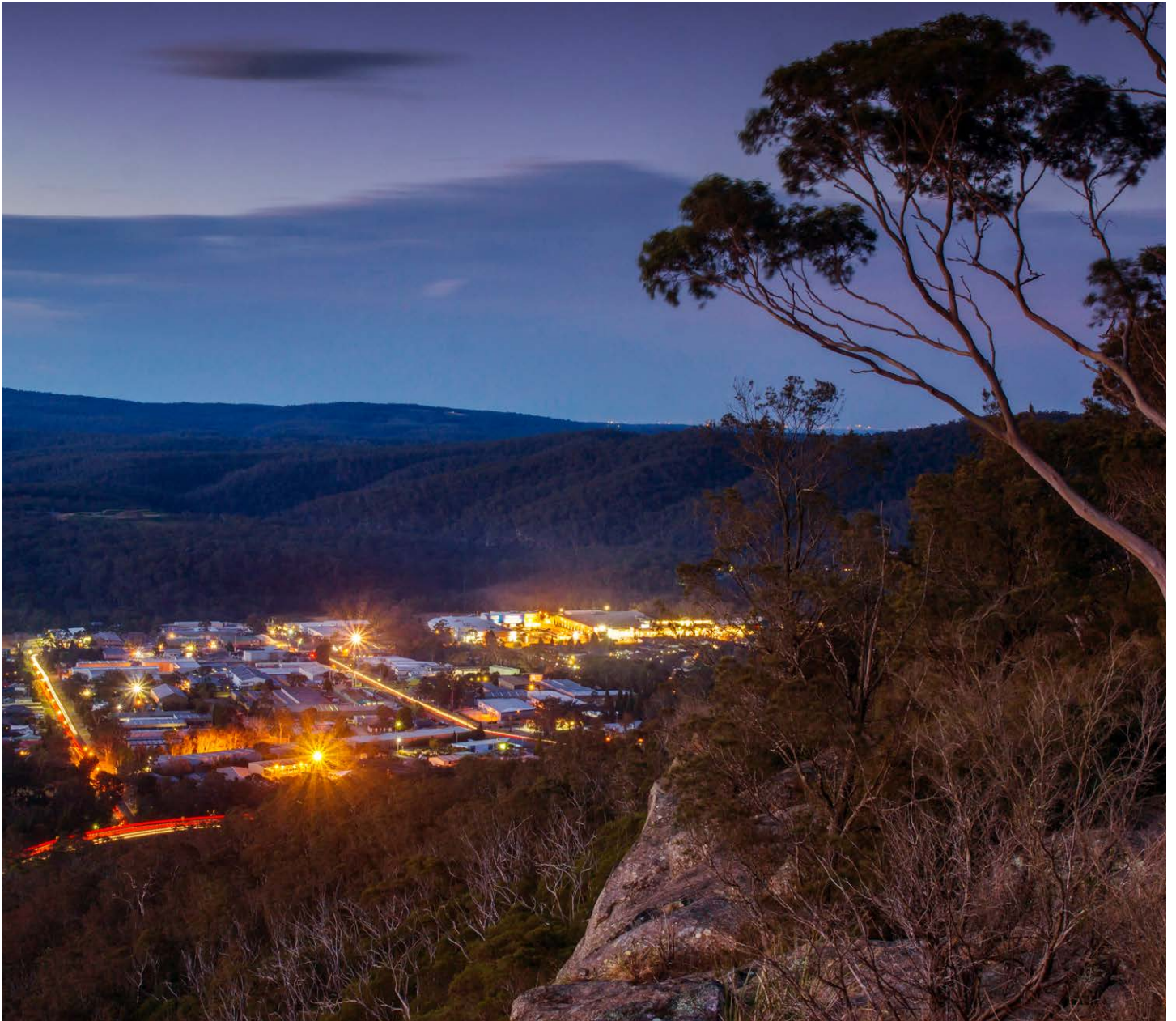
View to over town in the southern highlands.