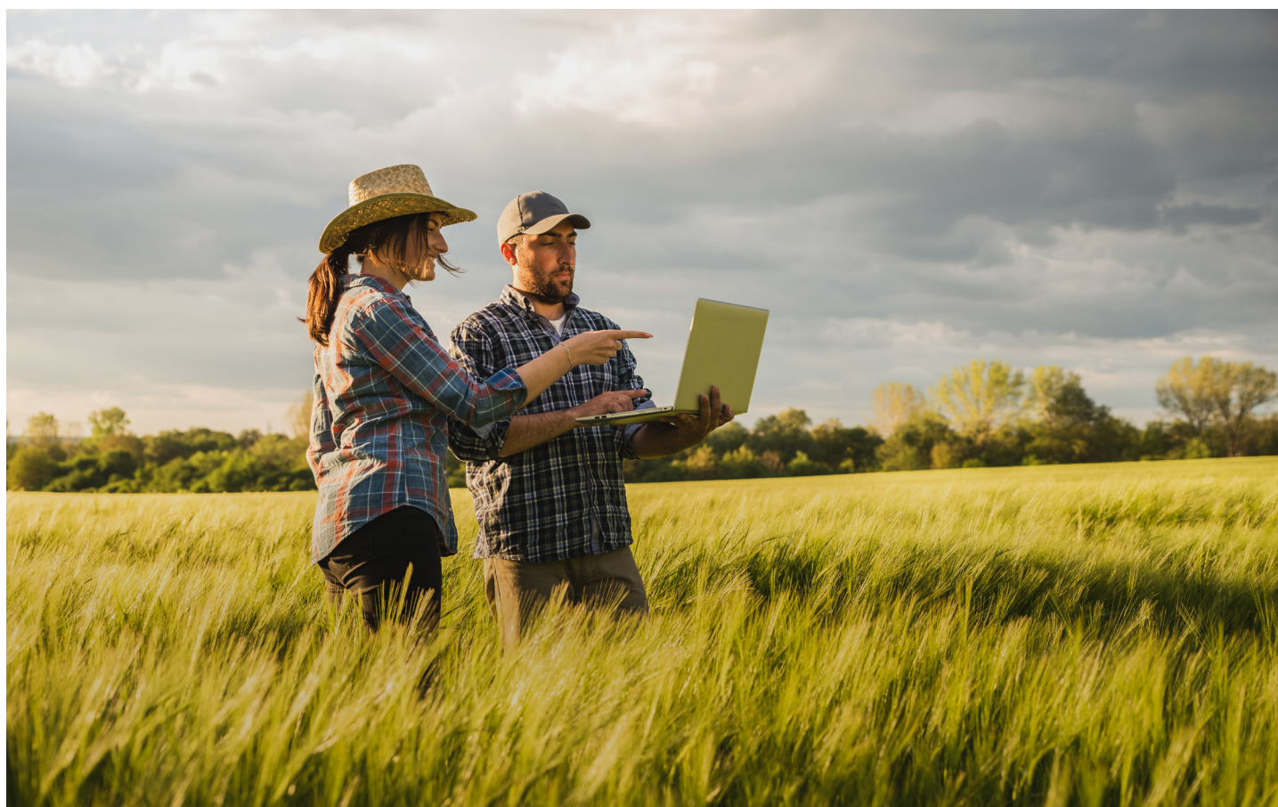
Farmers with laptop in field examining crops.

Final Report is published in 2023 and outlines the schedule for REZ transmission development in NSW. It is published alongside the Consumer Trustee's updated optimal 20-year Development Pathway for electricity infrastructure in NSW.