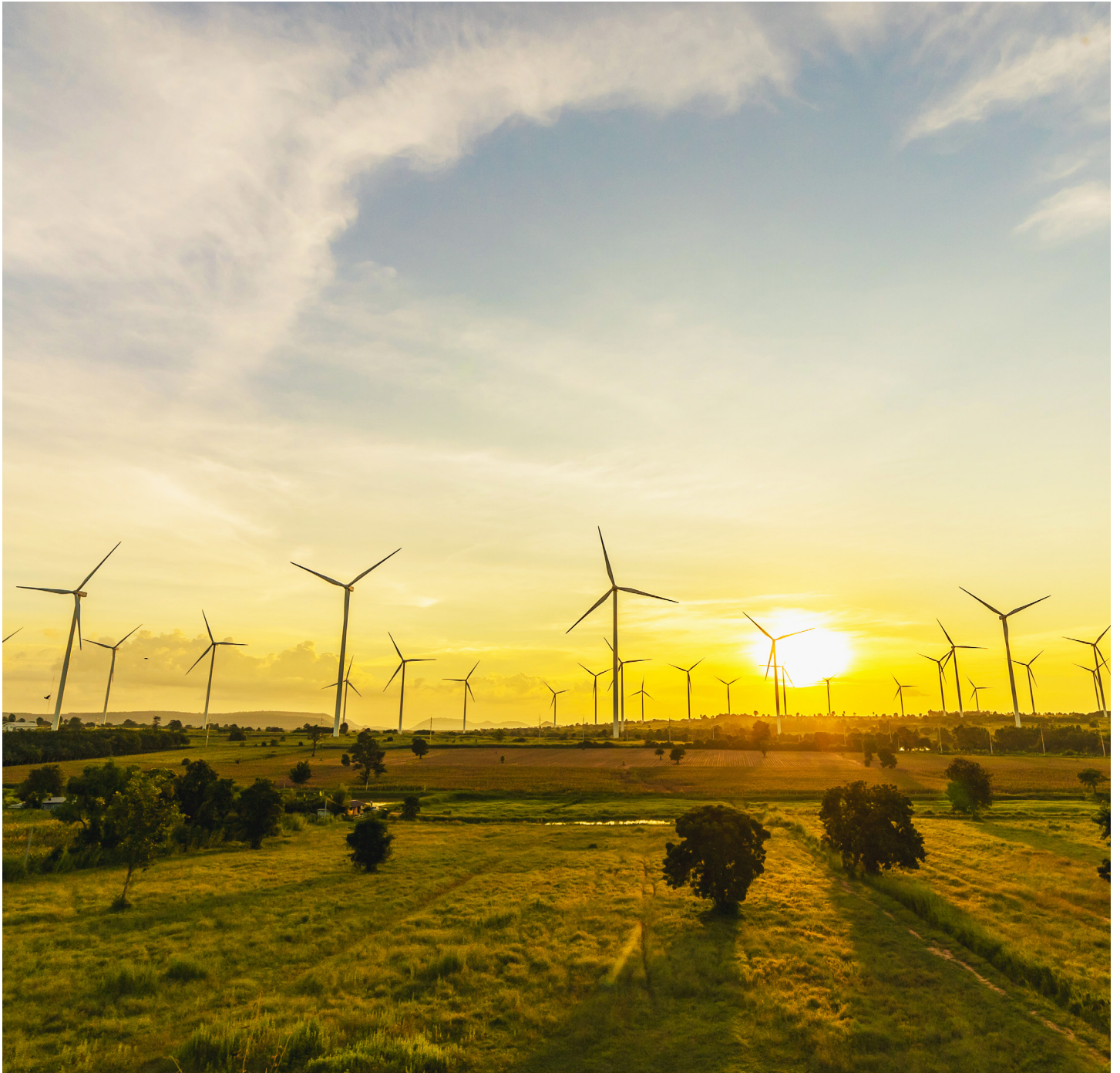
Wind turbines.