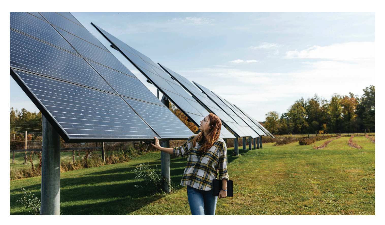
Energy Corporation of NSW (EnergyCo)

Please visit our website at <u>energyco.nsw.gov.au</u> to download an application form. Alternatively, please contact our team for further details.