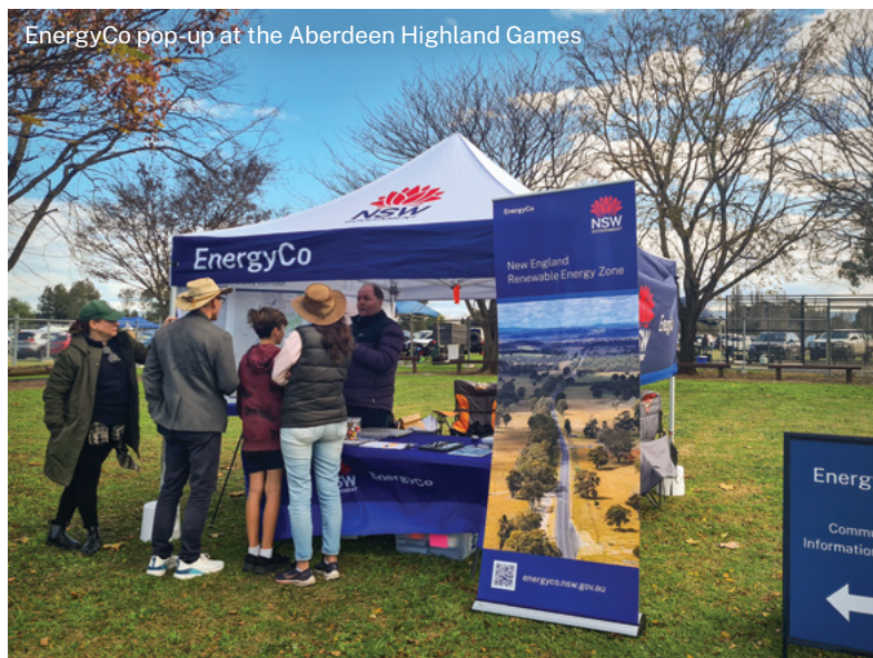
EnergyCo pop-up at the Aberdeen Highland Games