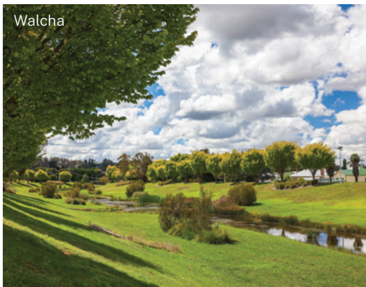
A field near Tamworth

EnergyCo is leading the delivery of the New England REZ network infrastructure project to connect new renewable energy generation and storage in the REZ to the existing electricity network. EnergyCo is required to carry out a range of detailed assessments to inform the planning and approval process for the project.