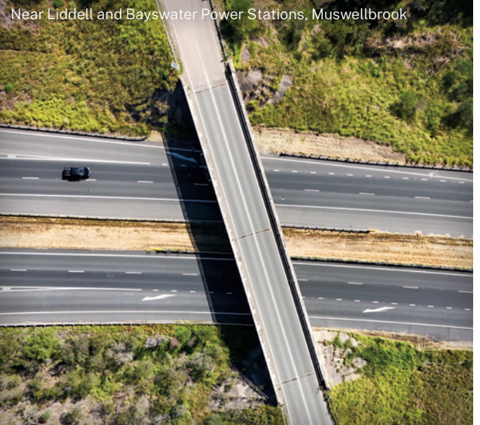
Near Liddell and Bayswater Power Stations, Muswellbrook

A Bushfire Assessment will be carried out to consider potential risks to public safety, property and project infrastructure and identify mitigation and management measures. Other key potential hazards and risks assessed as part of the EIS include electromagnetic fields, dangerous goods and hazardous materials, and land contamination.