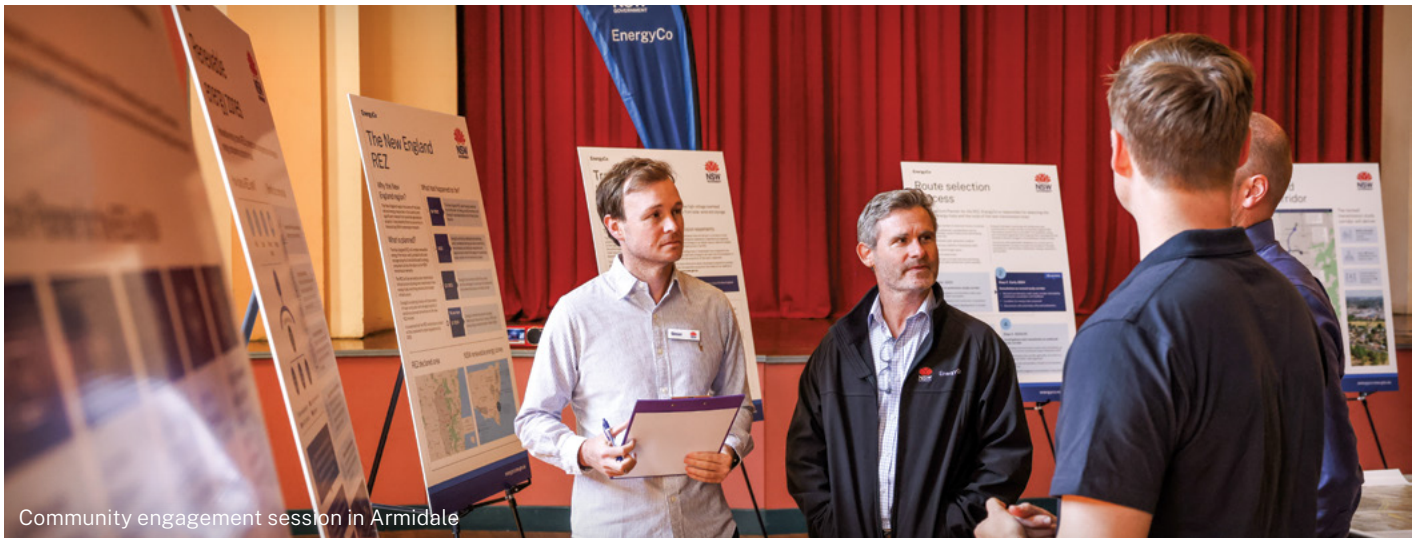
Community engagement session in Armidale